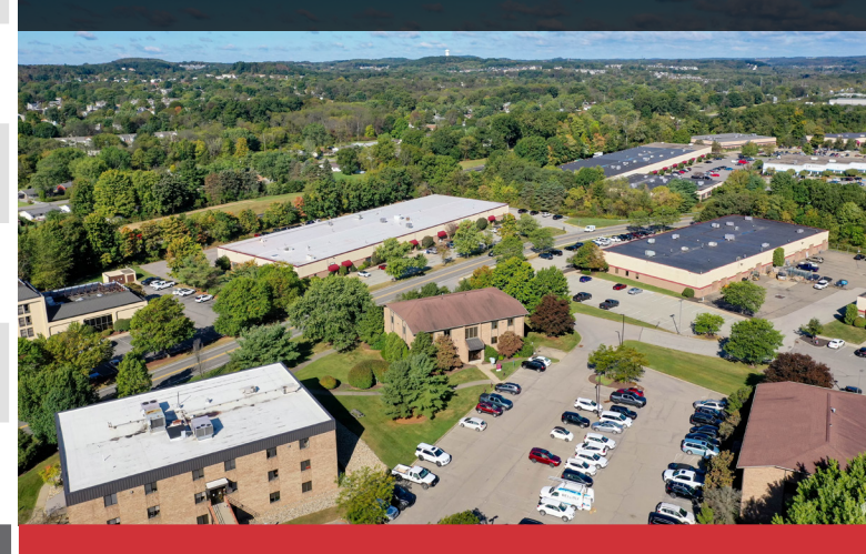
217 Executive Drive