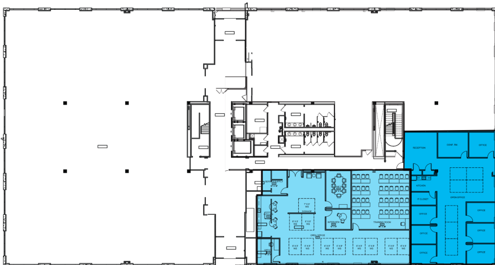
SUITE 400 4,000 RSF